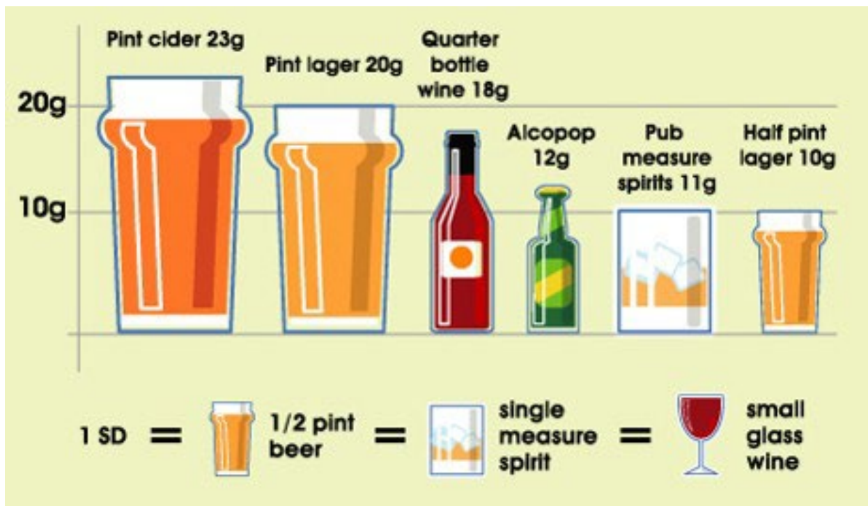
Picture 1: Definition of one standard drink in Ireland

In Ireland, one standard drink/ unit of alcohol has about 10gram of pure alcohol in it, e.g. a half pint of 3.5% beer or lager, or one 25 ml pub measure of spirits.