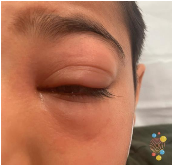
Image 2: Periorbital (Pre-septal) cellulitis [2].

Please note that the images below are a representation of the features of pre-septal and orbital cellulitis. They should not be relied upon solely to reach a diagnosis and each patient should be comprehensively evaluated clinically and with radiological studies as indicated.